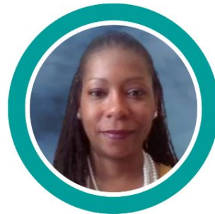
Valencia Applegate Sm - Z